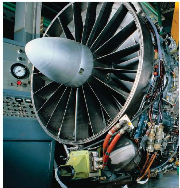
Krytox® XHT Grades: Extreme Conditions, Extreme Performance

Krytox® XHT greases are available with useful temperature ranges up to 360 °C (680 °F) for continuous use, with spikes to 400 °C (752 °F), when used in proper metallurgy with periodic re-lubrication.