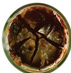
In oven at 232 °C (448 °F) for 40 hr: Hydrocarbon—40% wt loss