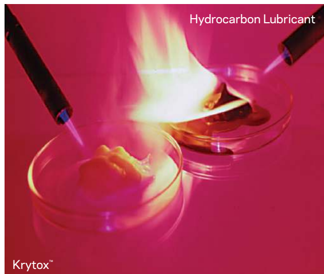
Hydrocarbon-based lubricants burn; Krytox™ does not.

During depolymerization, gaseous decomposition products are given off, and the remaining fluid is less viscous; but, no sludge or gummy deposits are formed.