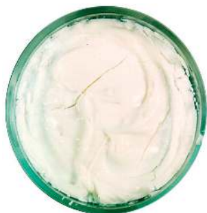
In oven at 232 °C (448 °F) for 40 hr: Krytox™—0% wt loss