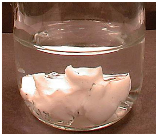
Krytox™ grease in hydrocarbon solvent is not dissolved.