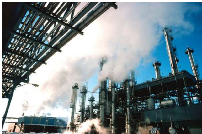
Krytox™ XHT greases can be used in many industrial applications in extreme thermal conditions.