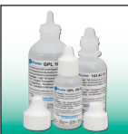
Dropper Bottles Oil: 3-6 grams 1/2 oz, 1 oz, 2 oz, 4oz, 8 oz