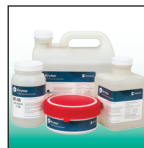
Containers Oil & Grease 0.5 Kg (1.1lb), 1 Kg (2.2 lb) 5 Kg (11 lb)