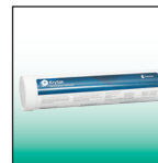
Cartridge (Standard Size) Grease: 0.8 kg (1.76 lb)