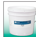
Pails Oil: 10 Kg (22 lbs), 20 Kg (44 lbs), Grease: 7 Kg (15.4 lbs), 20 Kg (44 lbs), Drums: 100 Kg, 200 Kg